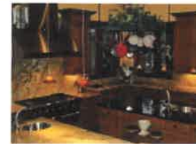
Wide Variety of choices, colors and styles

Linn's Prestige Kitchens & Baths will arrange a meeting with your personal renovation consultant to create the "Dream Kitchen" that you have always wanted. As a nationally award winning designer and installer, Linn's will take you through the process with the greatest of ease for a complete or partial kitchen makeover up to $25,000. www.linnskitchens.com