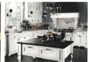
Updating kitchens improves homes value